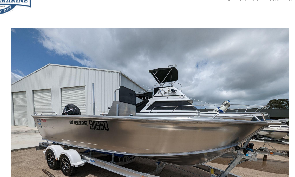
x Fishseeker 600 Custom Console Hydraulic Steering Mercury 75hp EFI Tandem $53,990.00