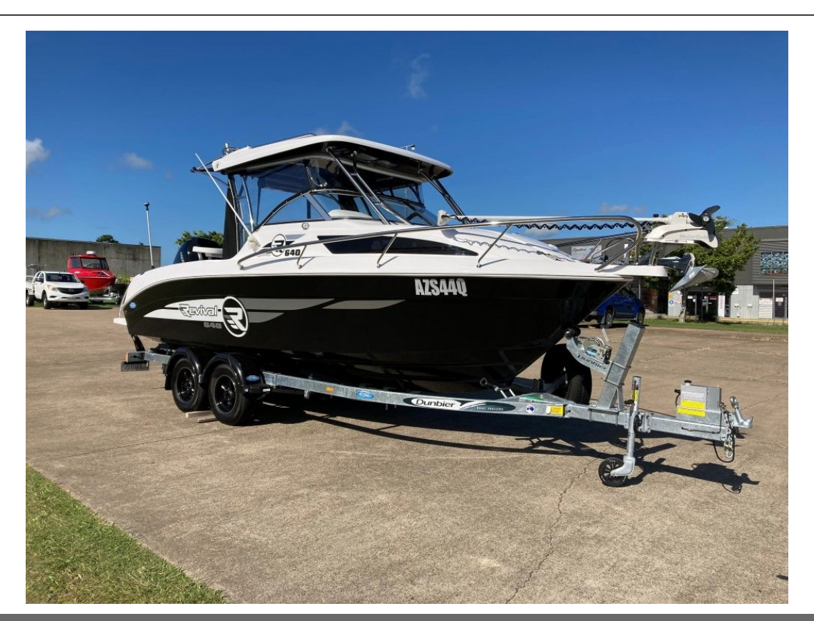
2024 Revival R640 Hard Top Mercury 3.0lt 150hp Dunbier Trailer $113,990